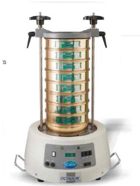
Sieves supplied separately