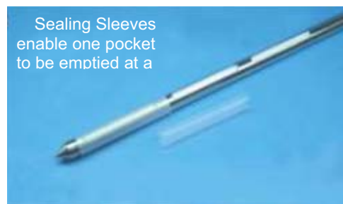
Sealing Sleeves enable one pocket to be emptied at a