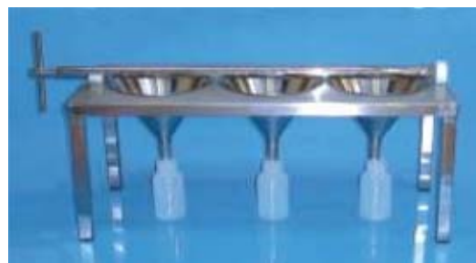
Emptying Rack allows samples to be deposited directly