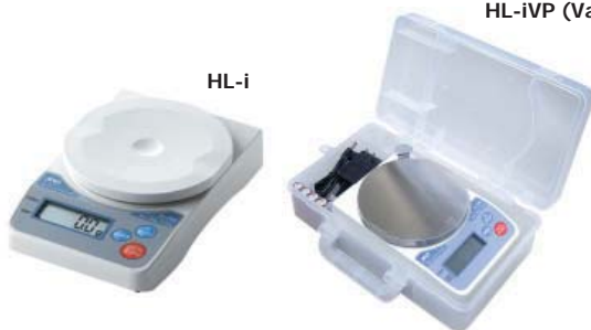
HL-iVP (Value Pack)