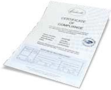
Certificate of Compliance Supplied with every test sieve

Endecotts test sieves are of the highest quality and are designed for accurate and efficient particle analysis.