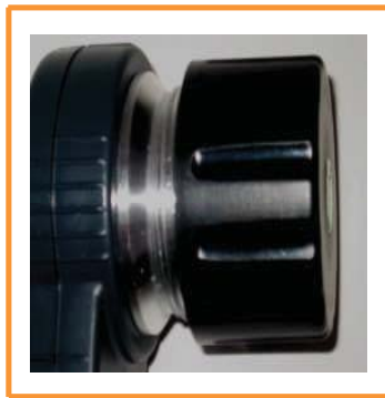
Figure 1 c

✘ Screw cap under tightened. Stainless steel indicator sunken in cap