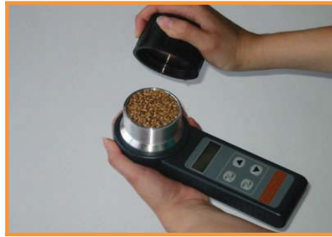
Figure 1a. Fill the measuring cell evenly to the top, ensuring the crop is level with the top of the cell. Screw on the cap and tighten until the stainless steel pressure indicator is flush with the top of the cap.