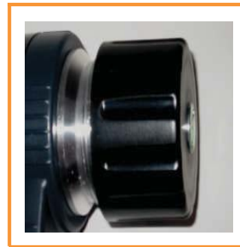
Figure 1 d

✔ Screw cap correctly tightened. Stainless steel indicator level with cap